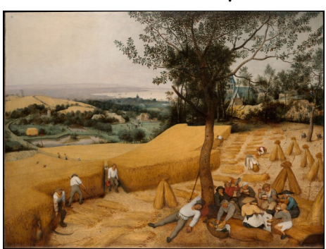
The Harvesters by Pieter Bruegel the Elder (The Metropolitan Museum of Art, New York