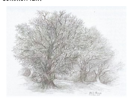
Cuckoo Hill: Blackthorn

Over the next few centuries, as land ownership started to consolidate based hunting rights process on (a formalised, but not started by the invasion). management started to appear in the historical record. Arkengarthdale became part of the New Forest. Although sometimes referred to as 'Swaledale Forest', Swaledale west of Grinton is more correctly the 'free chase of Swaledale'. Forests were royal and subject to forest law while chases were privately owned and subject to common law.