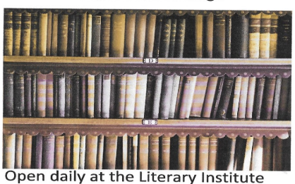
All proceeds go to the upkeep of the Hall